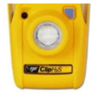
Clip-H2S Personal Monitor-24 Months